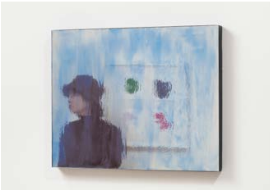
Collision #5, Blue 41 x 53 cm Alkyd-based color on mirror 2019