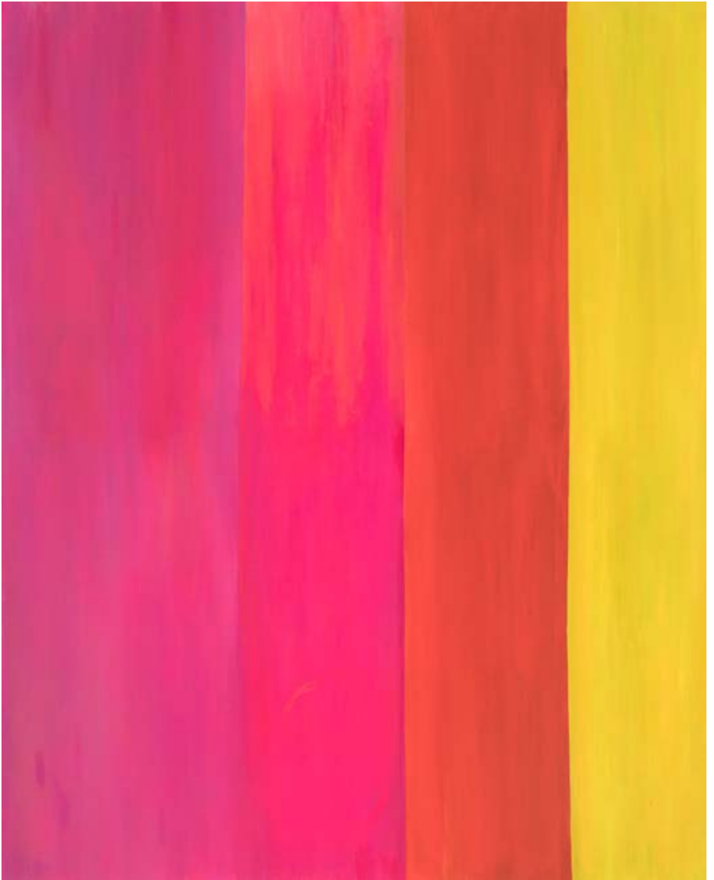
Screen III, acrylic on canvas, 162 x 130cm, 2019