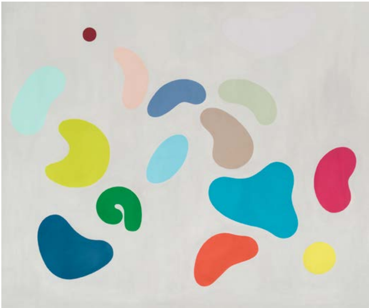
새로운 종류의 행복 A New Kind of Happiness, acrylic on canvas, 100 x 120cm, 2019