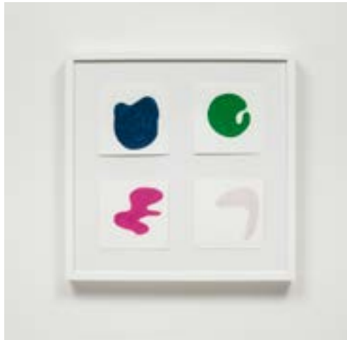
4개의 덩어리들 그리고 The Four Deongeori And Acrylic on paper, 52.5 x 52.5cm, 2019