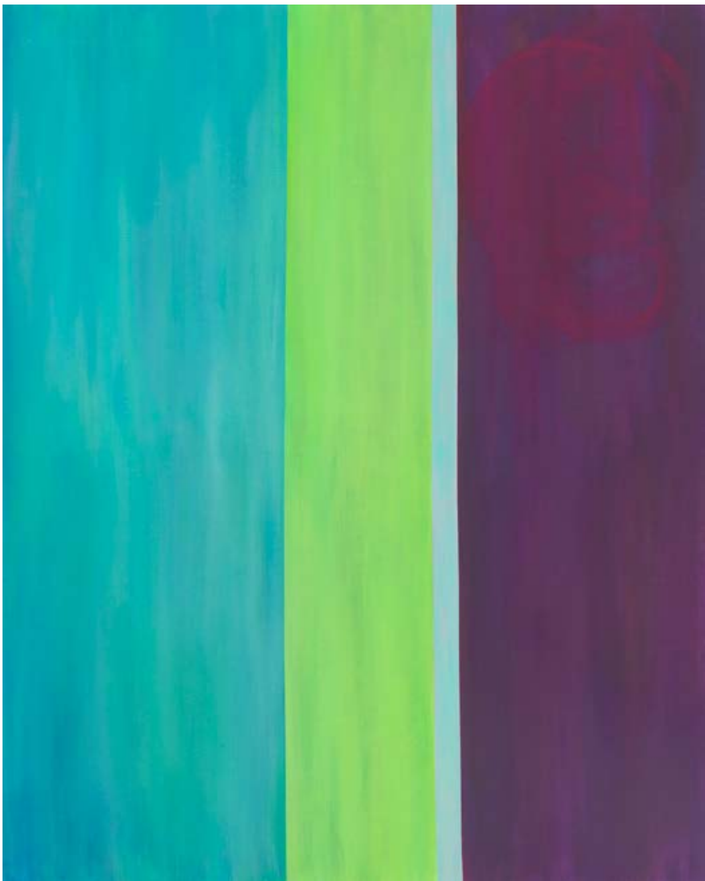
Screen I, acrylic on canvas, 162 x 130cm, 2019