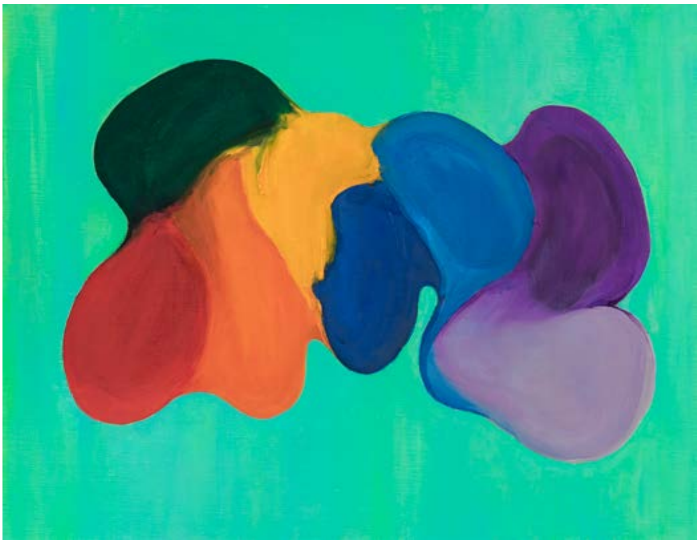
Collision #4, Green 41cm x 53cm Oil and acrylic on linen panel 2019