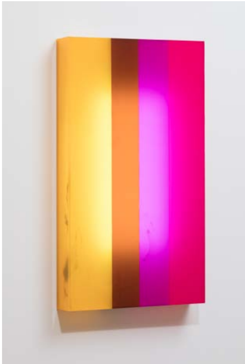
Screen Stain :我想请您吃饭, 70 x 40 x 7.5cm, LED screen, 2019