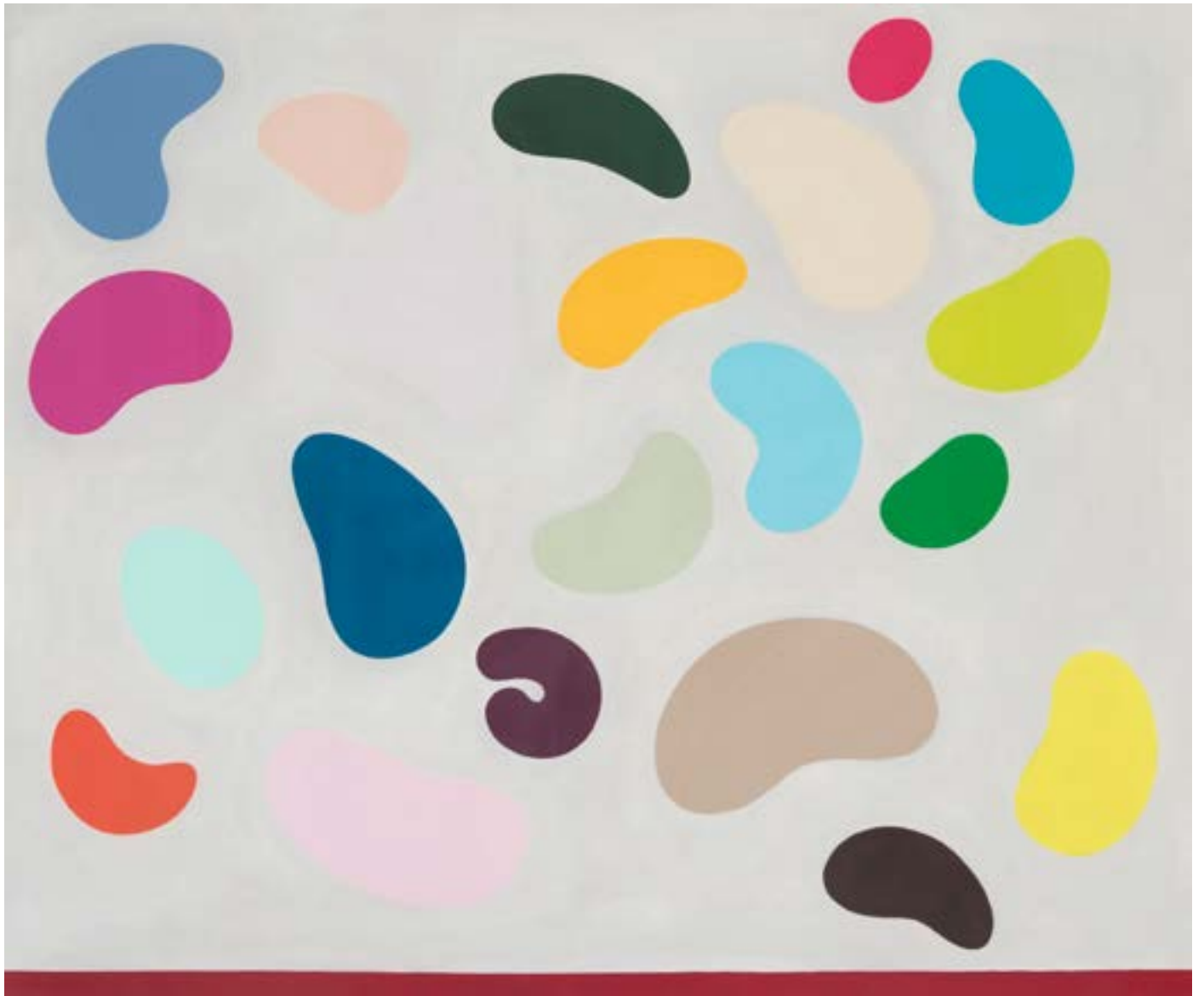
웅성거림 Le Murmure, acrylic on canvas, 100 x 120cm, 2019