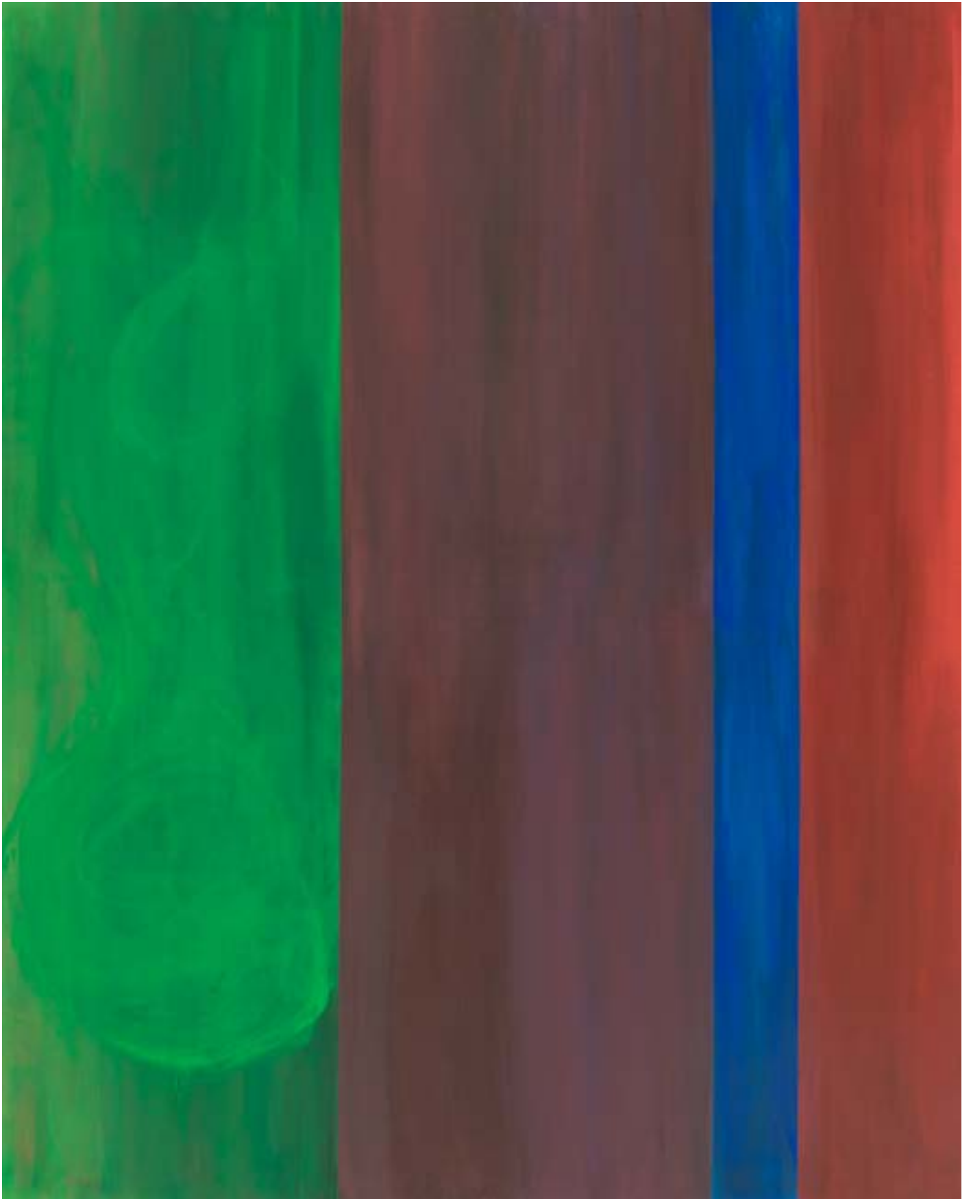
Screen II, acrylic on canvas, 162 x 130cm, 2019