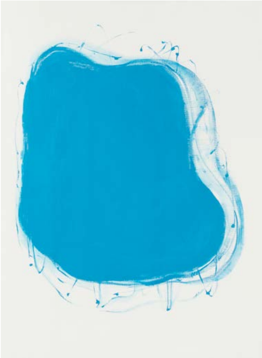
Vibrating Blue Deongeori , acrylic on canvas, 80.6 x 59.4 cm, 2019