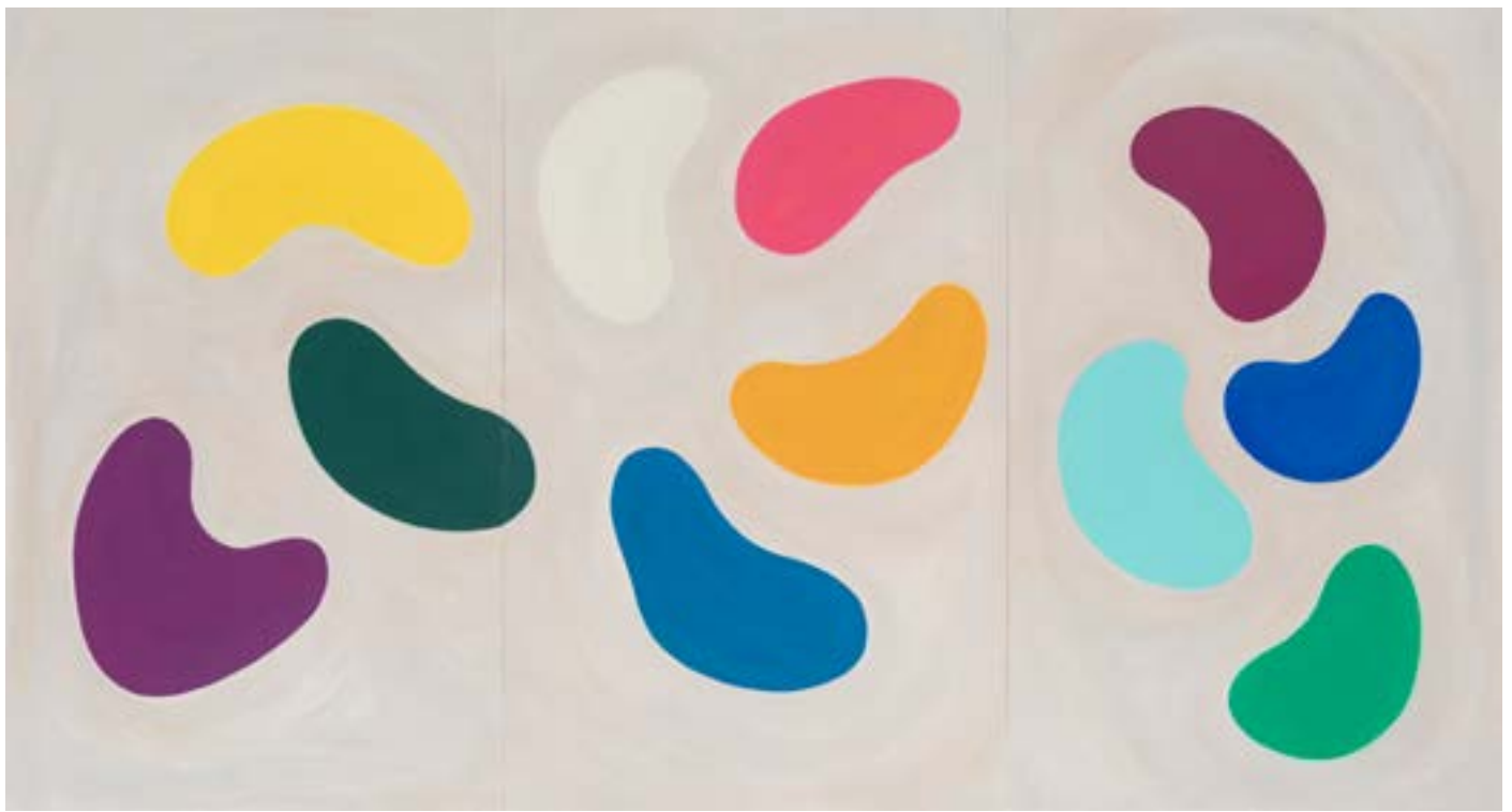
당신과 친해지는 법 The Remainder of the Remainder Acrylic on wood panel 116.8cm x 218cm 2019