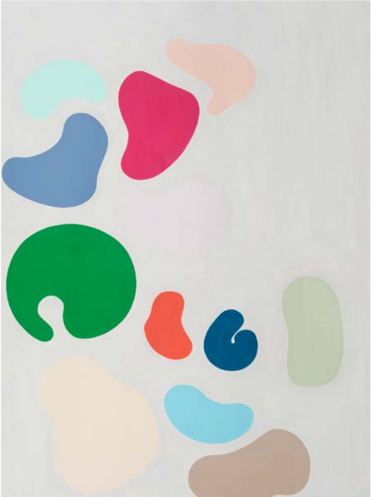
흐름 I | Heurem I, acrylic on canvas, 130 x 97cm, 2019