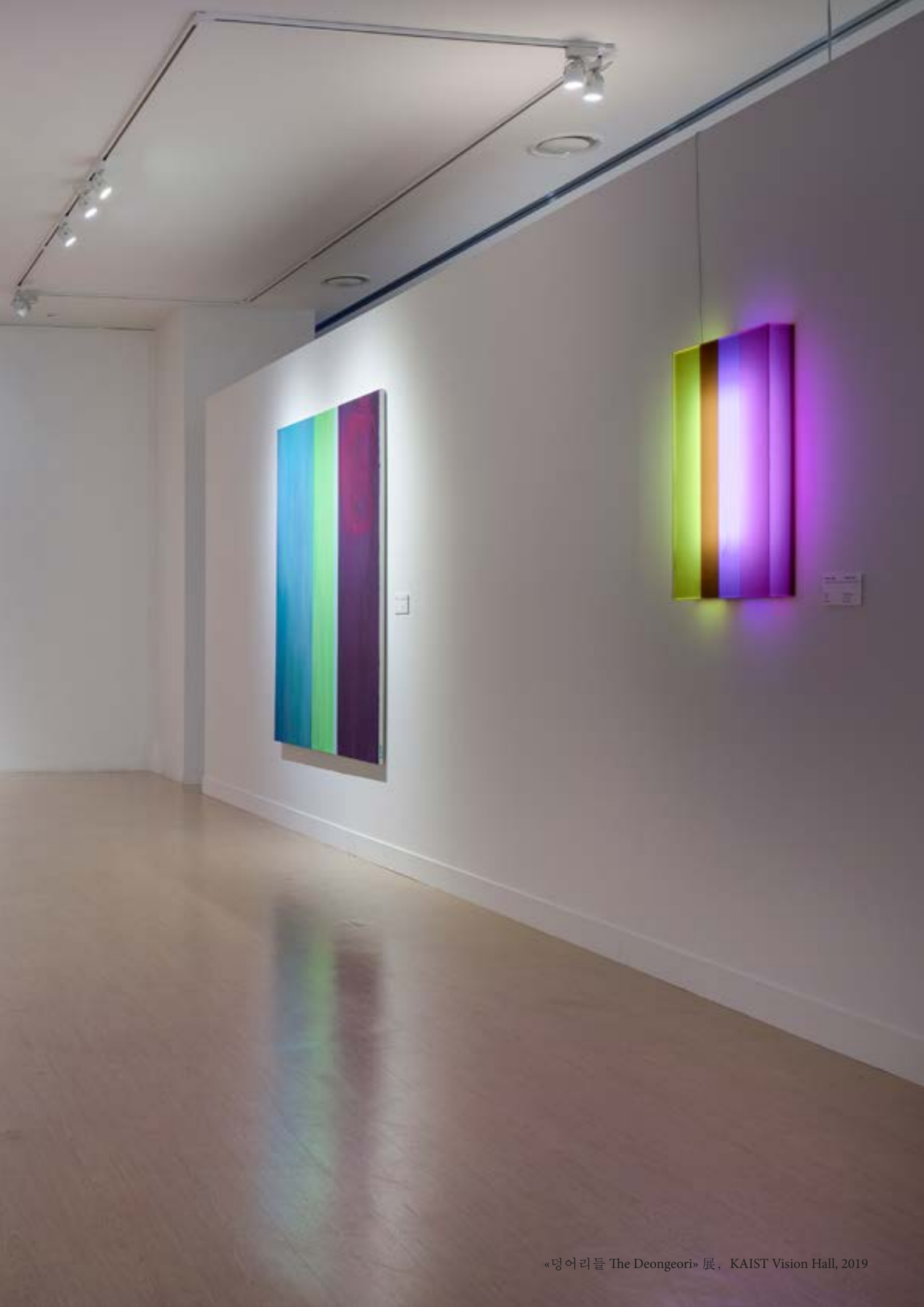
«뎅어리들 The Deongeori» 展, KAIST Vision Hall, 2019